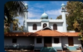
CHERAMAN JUMA MASJID 43 KM