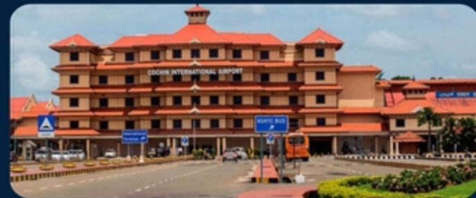
COCHIN INTERNATIONAL AIR PORT 69 KM