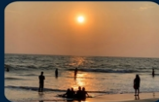
SNEHATHEERAM BEACH 15 KM