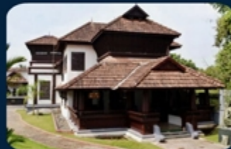
AYURVEDA MUSEUM 27 KM