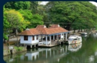
MUZIRIS HERITAGE PROJECT 40 KM