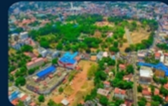
THRISSUR TOWN 18 KM