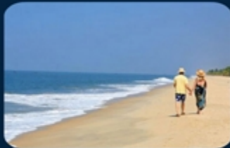
CHAVAKKAD BEACH 12 KM