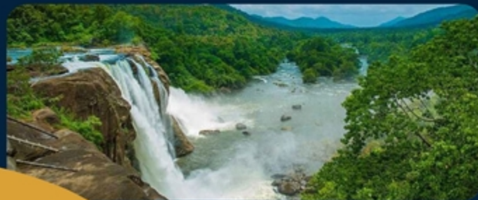
ATHIRAPPILY WATER FALLS 65 KM