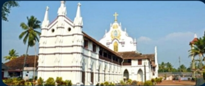
PALAYUR CHURCH 10 KM