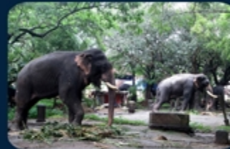
PUNNATHUR KOTA ELEPHANT SANCTUARY - 15 KM