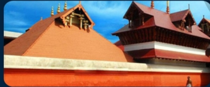
GURUVAYUR TEMPLE 12 KM