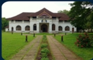
SAKTHAN THAMPURAN PALACE MUSEUM & ZOO - 18 KM